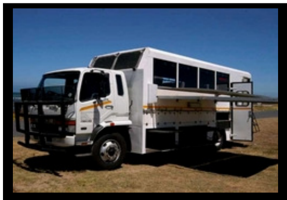
Overland Truck (example)