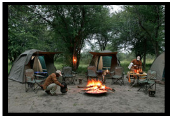
Canvas tents (example)